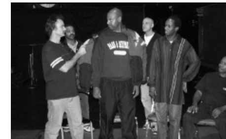
Y-Haven cast members rehearse a scene from the play, "On His Way," a unique partnership between Cleveland Public Theatre and Y-Haven.

The play depicts the story of a man who finds himself plagued by voices in his head and chased by demonic bounty hunters after escaping a troubled past. In the end, he chooses