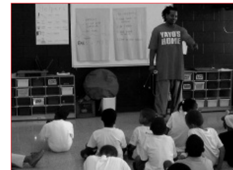
Boston Red Sox outfielder, and former Indians slugger, Manny Ramirez stopped at the Downtown YMCA Day Camp while in town and spoke with the children. Manny answered questions and shared stories with the kids about baseball and fitness.